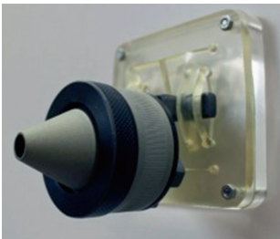
Fig. 1 GSP sampling head (DGUV 2016)